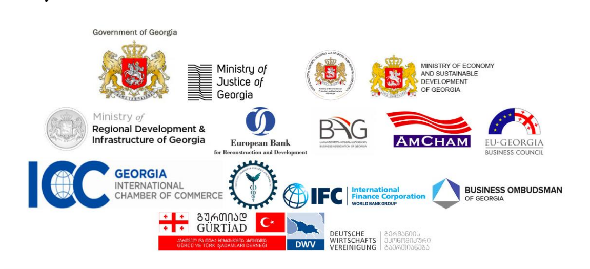
Picture 1. Investors Council is a platform connecting the private sector and the government.

The Investors Council is not meant to replace the activity of any institution or any Ministry, but rather to provide a platform for dialogue, coordination, and prioritization of policies pursued by the State in the business environment, and to analyze the effectiveness of their activity.