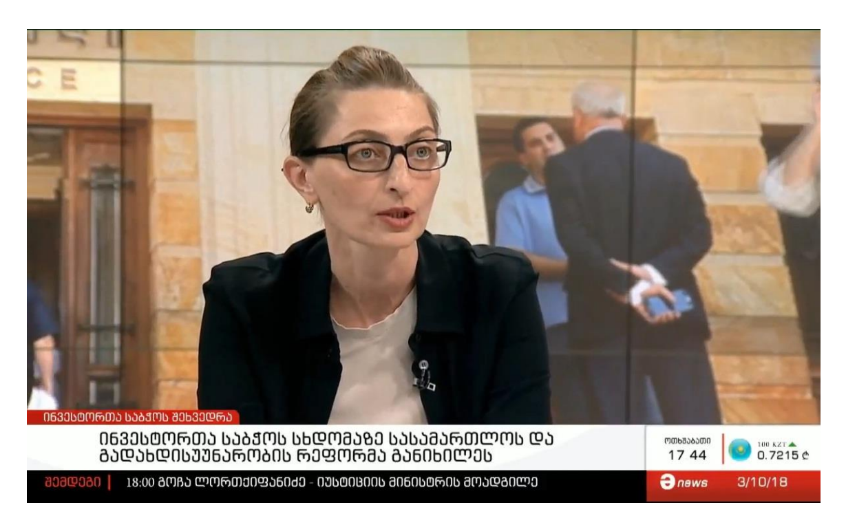
Picture 3. Head of Secretariat giving a live interview on Maestro TV about 9<sup>th</sup> IC meeting

ANNEX 1. Agenda and minutes of the 8th Investors Council meeting