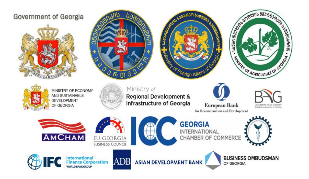
Picture 1. Investors Council is a platform connecting the private sector and the government.