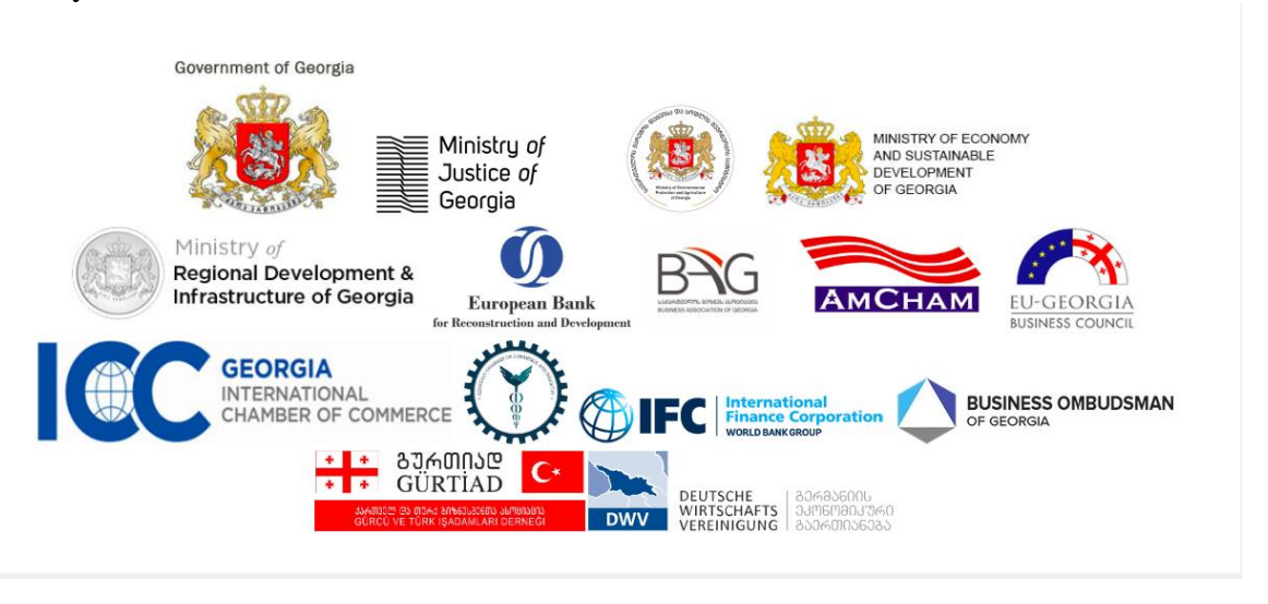
Picture 1. Investors Council is a platform connecting the private sector and the government.

The Investors Council is not meant to replace the activity of any institution or any Ministry, but rather to provide a platform for dialogue, coordination, and prioritization of policies pursued by the State in the business environment, and to analyze the effectiveness of their activity.